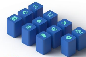
Full-Stack Payment Infrastructure for Every Industry.